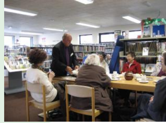
"a good value Council" audit commission

'Enabling more elderly people to stay safe and healthy in their own homes'